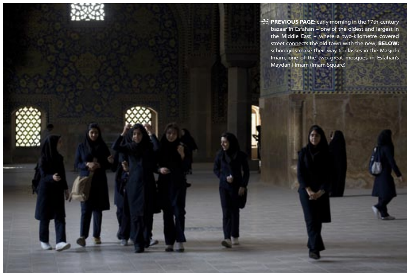
PREVIOUS PAGE: early morning in the 17th-century bazaar in Esfahan – one of the oldest and largest in the Middle East – where a two-kilometre covered street connects the old town with the new; BELOW: schoolgirls make their way to classes in the Masjid-i Imam, one of the two great mosques in Esfahan's Maydan-i Imam (Imam Square)