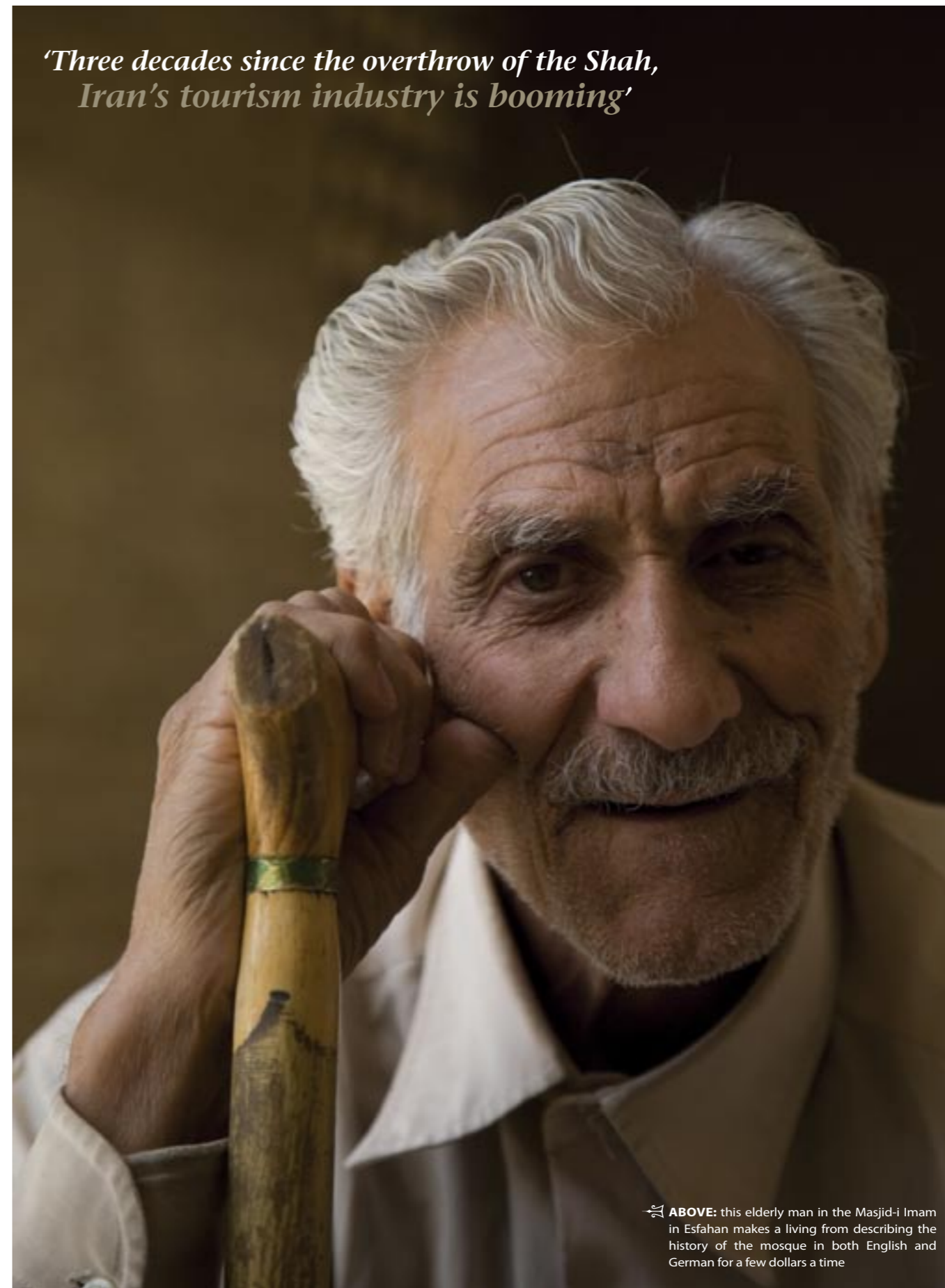
ABOVE: this elderly man in the Masjid-i Imam in Esfahan makes a living from describing the history of the mosque in both English and German for a few dollars a time

'Three decades since the overthrow of the Shah, Iran's tourism industry is booming'